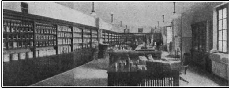
Cook County (Chicago) Hospital Pharmacy, one of the largest, if not the largest hospital, in U. S.

B EFORE completing his medical studies in Europe, Dr. John Morgan was pharmacist in the pharmacy of Pennsylvania Hospital, shown below. After his return, he assisted in organizing a medical school. He introduced in Philadelphia the practice of writing prescriptions, or, as he called it, "The regular mode of practicing physic." He strongly advocated the separation of pharmacy and of surgery from the practice of medicine proper, and argued, "We must regret that the very different employment of physician, surgeon and apothecary should be promiscuously followed by any one man; they certainly require different talents. Let each cultivate his respective branch apart, the physician, surgeon, apothecary, etc.; the knowledge of medicine will be then daily improved, and it may be practiced with greater accuracy and skill." Dr. Morgan, for a time, was in charge of the hospitals of the American Army.